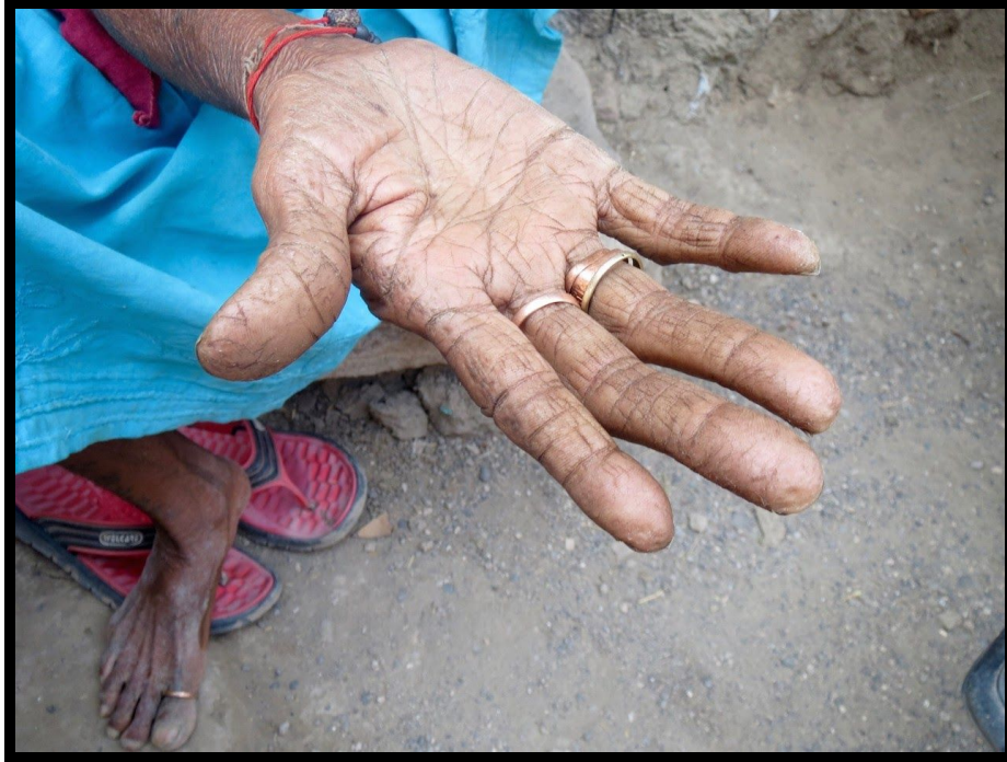
Figure 1: An old woman in Gujarat showed the cracked skin of her palms.