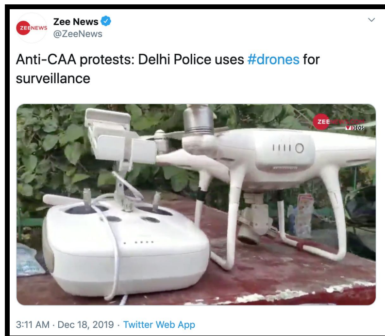
Figure 5: Documented usage of the DJI Phantom drone by the Delhi Police by Twitter account @ZeeNews.