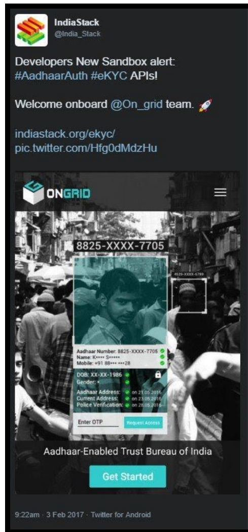
Figure 2: The contentious tweet revealing privacy vulnerabilities of Aadhaar.

Because a growing number of private services are being linked to peoples' Aadhaar numbers, private companies have a lot to benefit from their relationship with the UIDAI and Aadhaar. This marks the distinct merging of the state and corporate power, resulting in dangerous consequences. In 2018, it was reported that “a group of 50 companies consisting of fintech firms, lending companies, verification agencies” had formed a group called the Coalition for Aadhaar, committed to defending Aadhaar from the appeals of activists and lawyers who