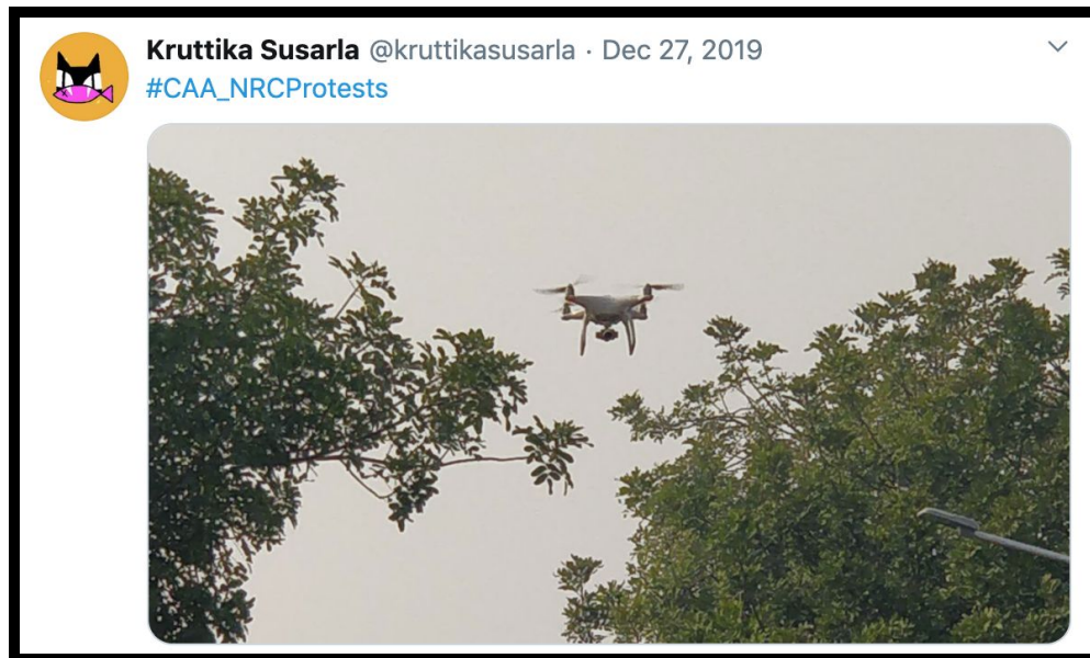
Figure 4: Drone spotted in New Delhi on December 27th, 2019 by Twitter user @kruttikasusarla.