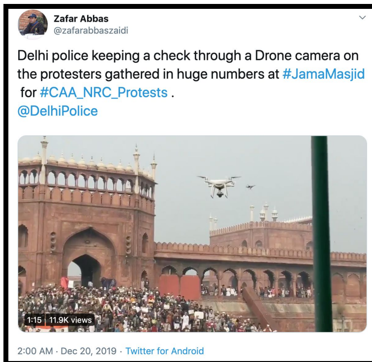
Figure 7: Drone surveillance used outside the Jama Masjid in New Delhi on December 20th.